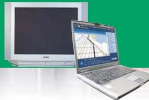
Electronics (Computers, Controls Entertainment System)

Cost $15,000 5 Year Life Cost /Year = $3,000