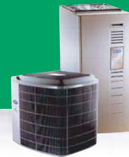
Motor Driven Equipment (Appliances, HVAC, etc.)

Cost $15,000 10 Year Life Cost /Year = $1,500