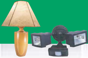
Lighting (Interior and Exterior)